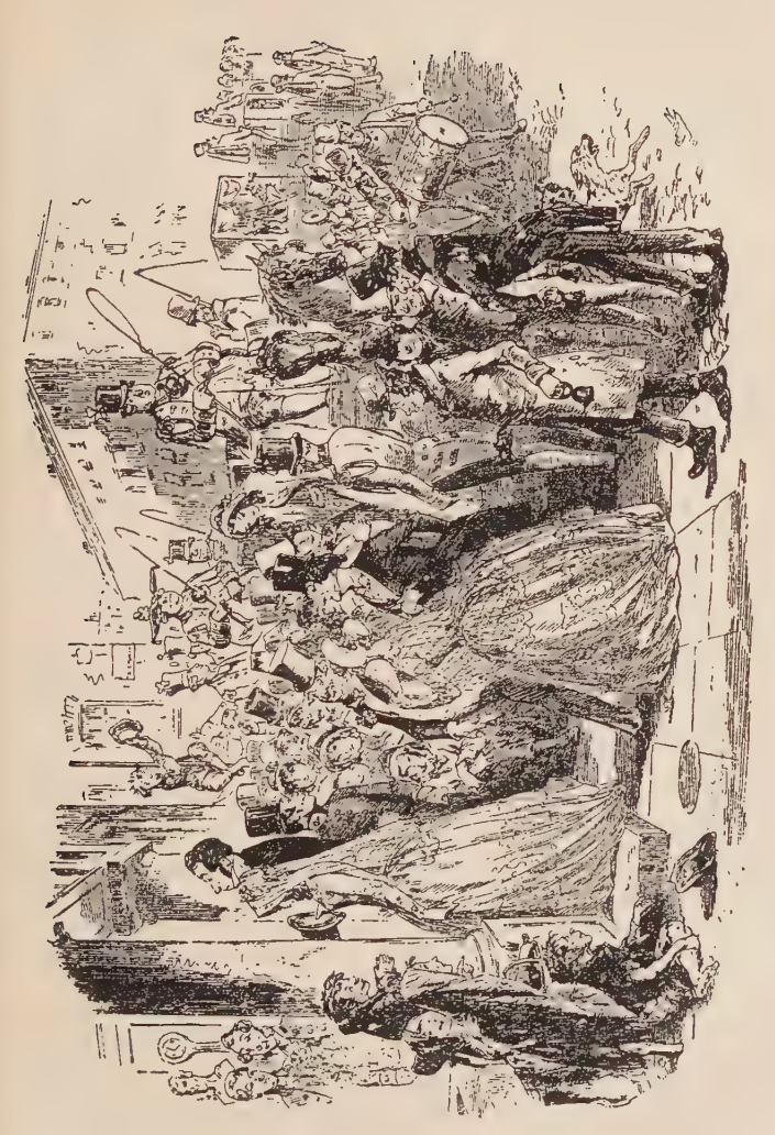
Coming Home from Church.